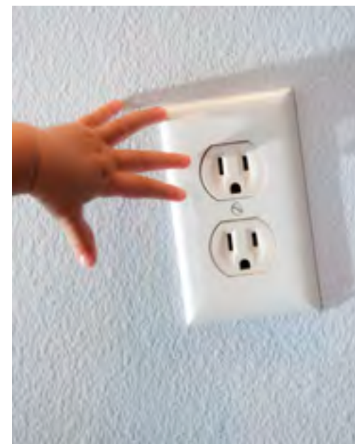
Prevent accidents by covering electrical outlets with plastic covers and tucking electrical cords out of reach.

To ensure safe surroundings for the smallest family members — even if they're just visiting — examine your home from a child's point of view. Nothing can substitute for adult supervision, but don't underestimate a child's strength, agility and curiosity.