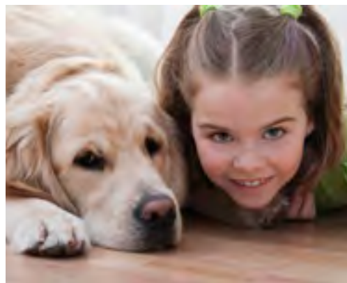
Pet dander is one of the most common indoor allergens.