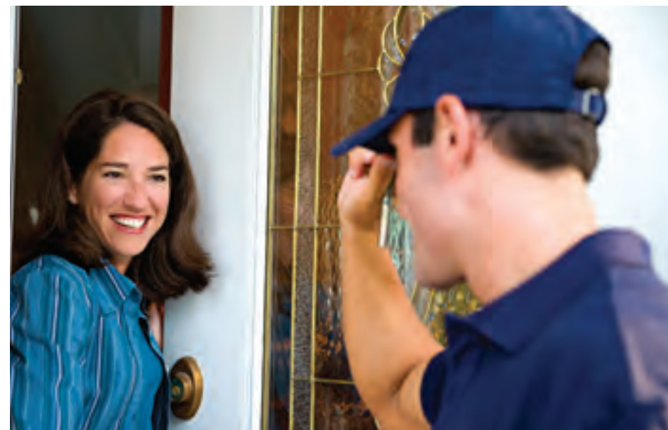
It's important to have a yearly check-up performed on your cooling system to detect and prevent problems before they occur.

Call us before the summer heat rolls in. We can help find solutions to your home comfort problems now — whether it's performing seasonal maintenance, adding new components to make your air conditioner work more efficiently, or replacing it with a higher-efficiency system — so you'll enjoy a comfortable and care-free summer. ●