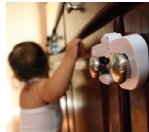
Ensure safe surroundings for the smallest family members by using safety locks to block access to kitchen cabinets.

If you have small children at home, or children that visit often, there are a few simple precautions you can take to prevent many common household accidents. To begin with, never underestimate a child's strength, agility and curiosity.