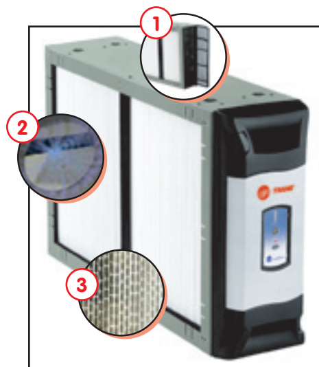
TRANE CleanEffects 1. Traps the large particles 2. Charges the small ones 3. Collects the smaller particles.

Consider adding an air cleaner. If you're currently using an inexpensive filter in your heating and air conditioning system, upgrade to a high-efficiency media filter. Filters that are rarely changed can aggravate allergy problems and lower the quality of your indoor air. If you're still not getting the relief you're seeking, it may be time to think about adding a whole-house air cleaner. Depending on your needs, there are a variety of types to choose from, including media, electrostatic and hybrid models. If you are considering a purchase, give us a call. We can help steer you in the right direction. As professional comfort consultants, we'll make your indoor environment as healthy as possible. ●