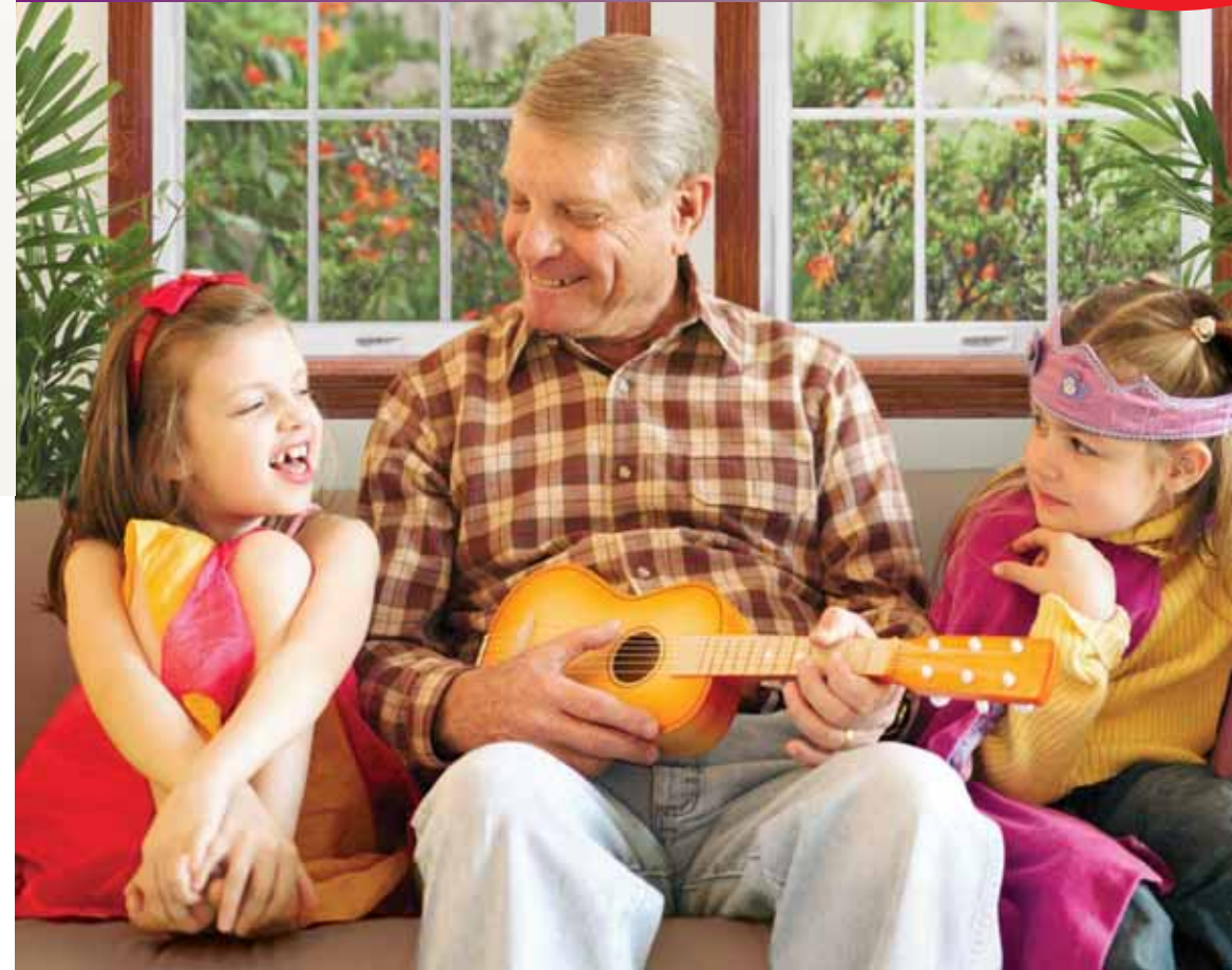
Keep your family comfortable and bills in check with a high-efficiency system.